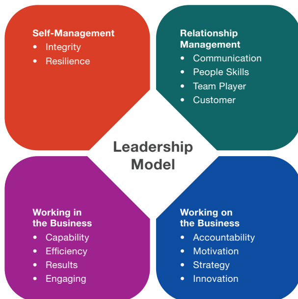
Figure 1. The Hogan 360 Leadership Model

The Hogan 360 (Peter Berry Consultancy, 2018) is a multi-rater survey that gathers leadership feedback from a variety of key stakeholder groups (i.e., managers, peers, direct reports, and others such as customers or stakeholders). As shown in Figure 1 below, the tool covers four key domains and 14 underlying competencies.