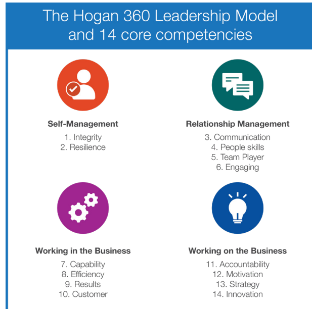
Figure 2. The Hogan 360 Leadership Model.

The Hogan 360 (originally developed by Peter Berry Consultancy) is a multi-rater survey that gathers leadership feedback from a variety of key stakeholder groups. The Hogan 360 is made up of scaled questions, ranked-option questions, and open-ended feedback; only the scores from the scaled questions were included in the present analyses. The scaled questions are combined to form four leadership competencies, as shown in Figure 2.