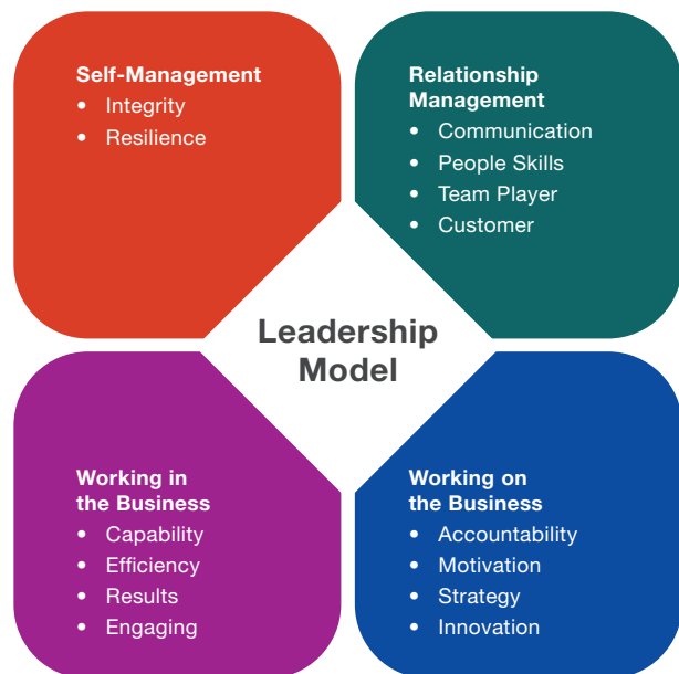
Figure 1. The Hogan 360 Leadership Model

This study focuses on data from the scaled items, as well as the ranked items designed to identify top strengths and top opportunities to improve.